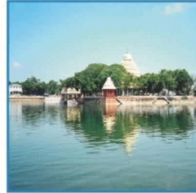
VANDIYUR MARIAMMAN POND