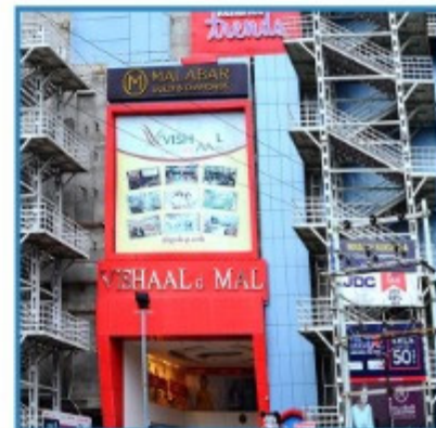
VISHAAL d MALL