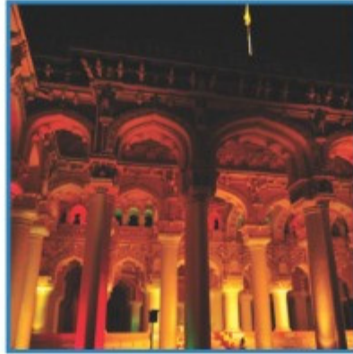
THIRUMALAI NAYAKKAR PALACE