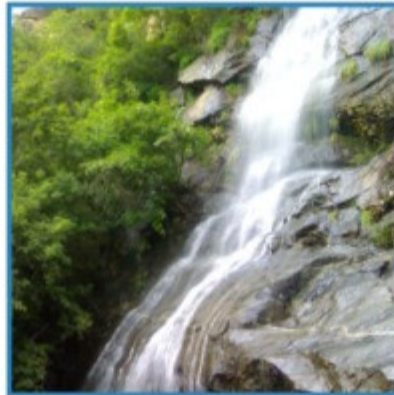
WATER FALLS (Kutladam Patti)